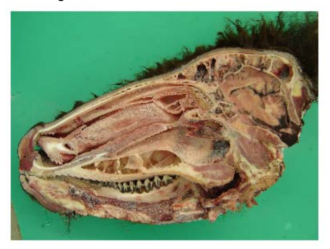
Figure 3 Bison

North American bison were first farmed in the UK in the mid-1990s. These animals are not aggressive, but 'defensive'. They have a large flight-zone and when approached will form an outward-looking circle. They can be difficult to put through traditional cattle-handling systems and can get very agitated when confined in such. Like water buffalo, bison have a very thick frontal bone (up to six times that of a domestic bovine at any given age), therefore effective, captive-bolt stunning might be difficult to achieve (see Figure 3). Bison can be field-slaughtered by a marksman, then abattoir-dressed; alternatively they can be transported to the abattoir and shot dead in the trailer prior to dressing.