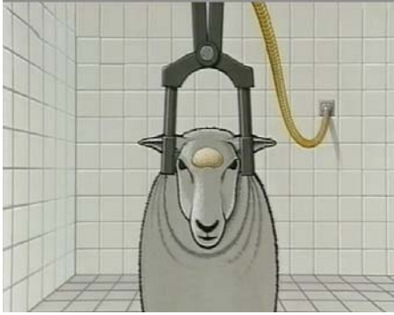
Electrode position (front view)