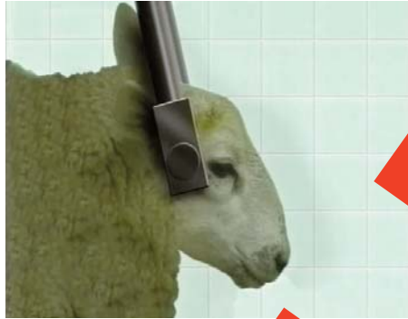
Electrode position (side view)