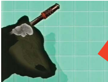
Penetrative captive-bolt position (side view)