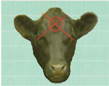
Penetrative captive-bolt position (front view)