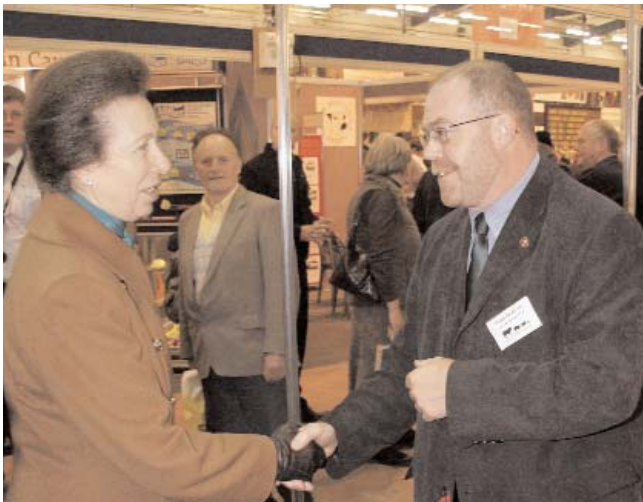
HRH Princess Anne visiting the HSA exhibition stand at the 2006 Royal Smithfield Christmas Fair

The closing date for applications for the 2007 Dorothy Sidley Awards was 26 February. The winners will be announced in the Annual Report in September.