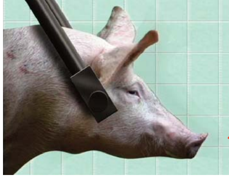
Alternative electrode position